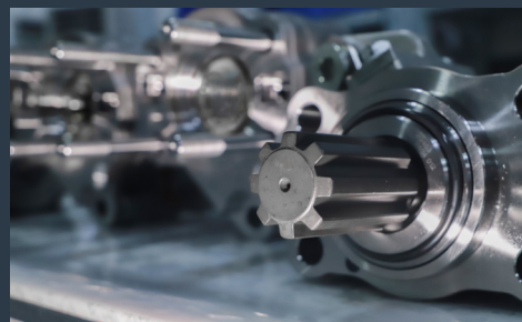
This rock drill has a heavy-duty design that makes it easy to drill even highly hard rock.