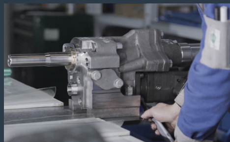
Specialized maintenance tools to ensure excellent performance and safe use of the rock drill.