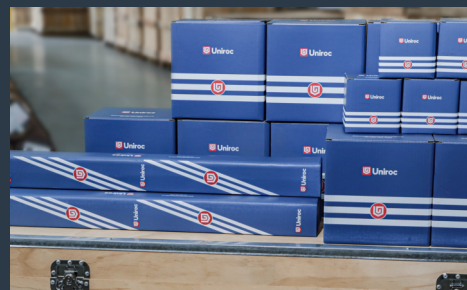
Two preventive maintenance packages are available to ensure rock drill service life.